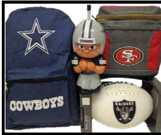
Licensed Sports and School Supplies Mon.-Fri.: 7:00am-5:00pm Sat.: 9:00am-4:00pm