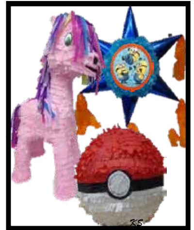
Large Assortment of Piñatas Ph.: 559-651-4800 RksVending@aol.com