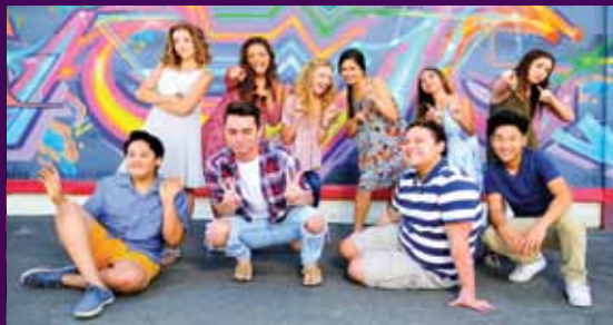
VISALIA TEEN IDOL