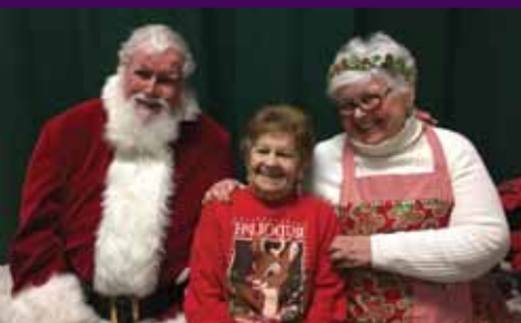
VISALIA SENIOR CENTER