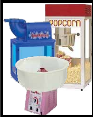
Party Rentals 9400 W. Placer Ave. Visalia, CA 93291