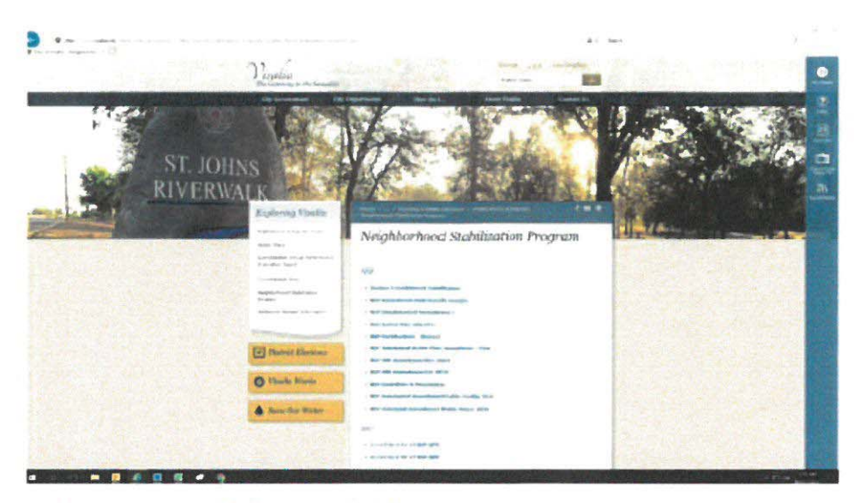
NSP Amendment and Public Notice posted-8.7.18