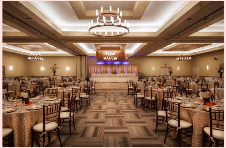
Exhibit Hall: Capacity 1,000