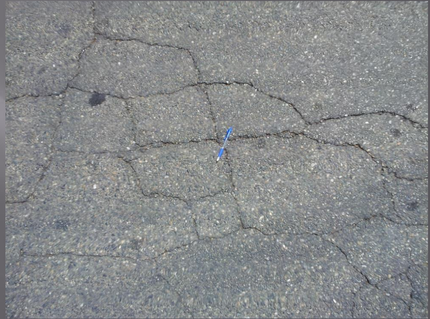
Floral - Main to Center